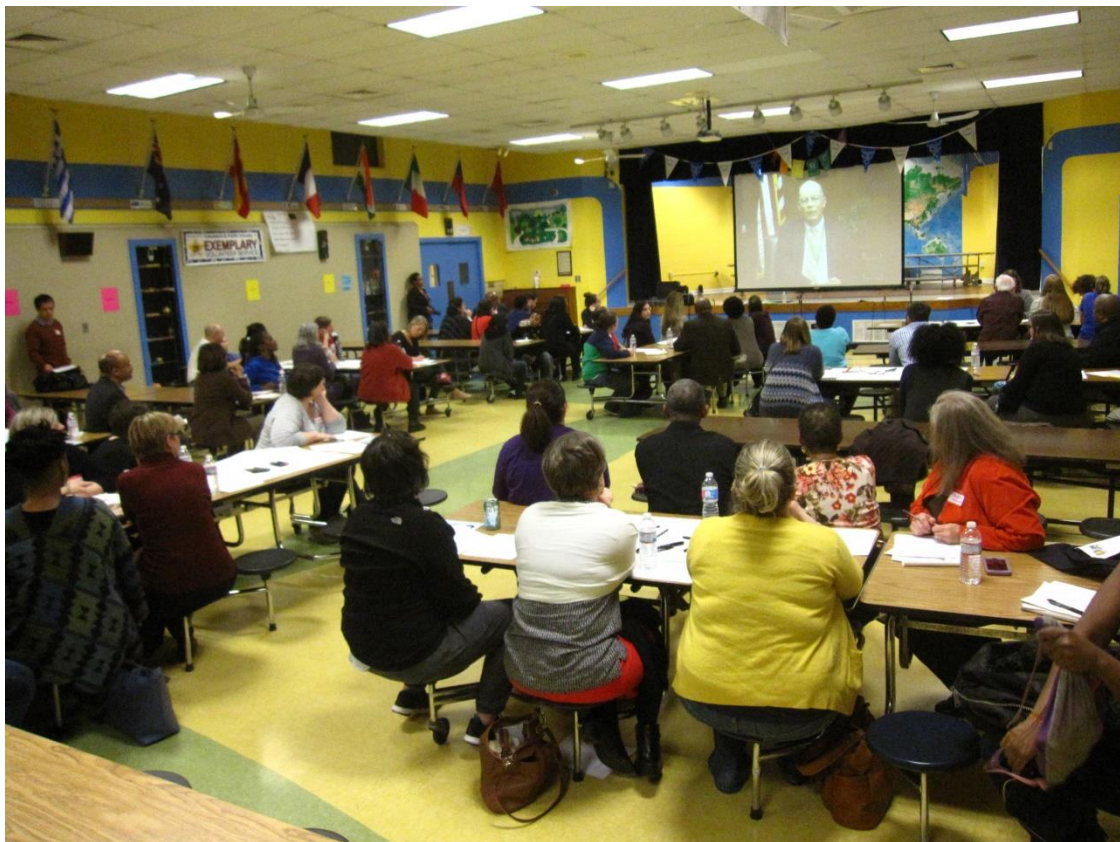
Image: Forum participants view a video update from Superintendent Kurrus.