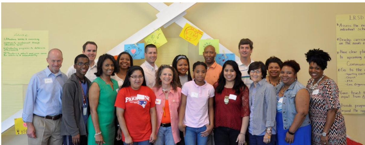
2015-2016 LRSD CAC Members