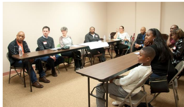
Images: Small group discussions at the fourth community forum.